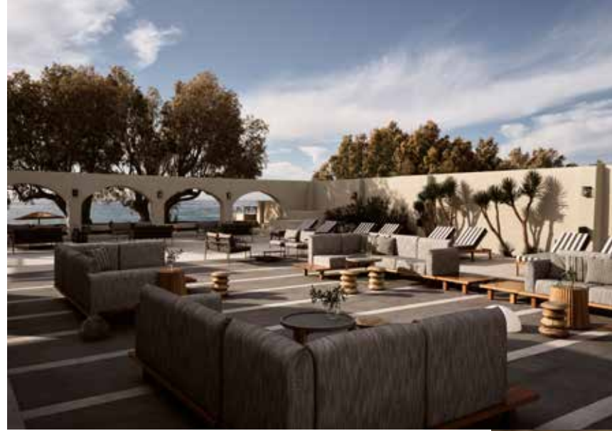
Clockwise from left: discover design details; refuel at beachside, al-fresco restaurant, Tamarisk; dine barefoot with friends; experience outdoor living in our Evergreen Retreat.

DESIGN-FIRST DETAILS STAND OUT AT NUMO IERAPETRA BUT, MUCH LIKE OUR LOCATION, NATURE LEADS THE WAY.