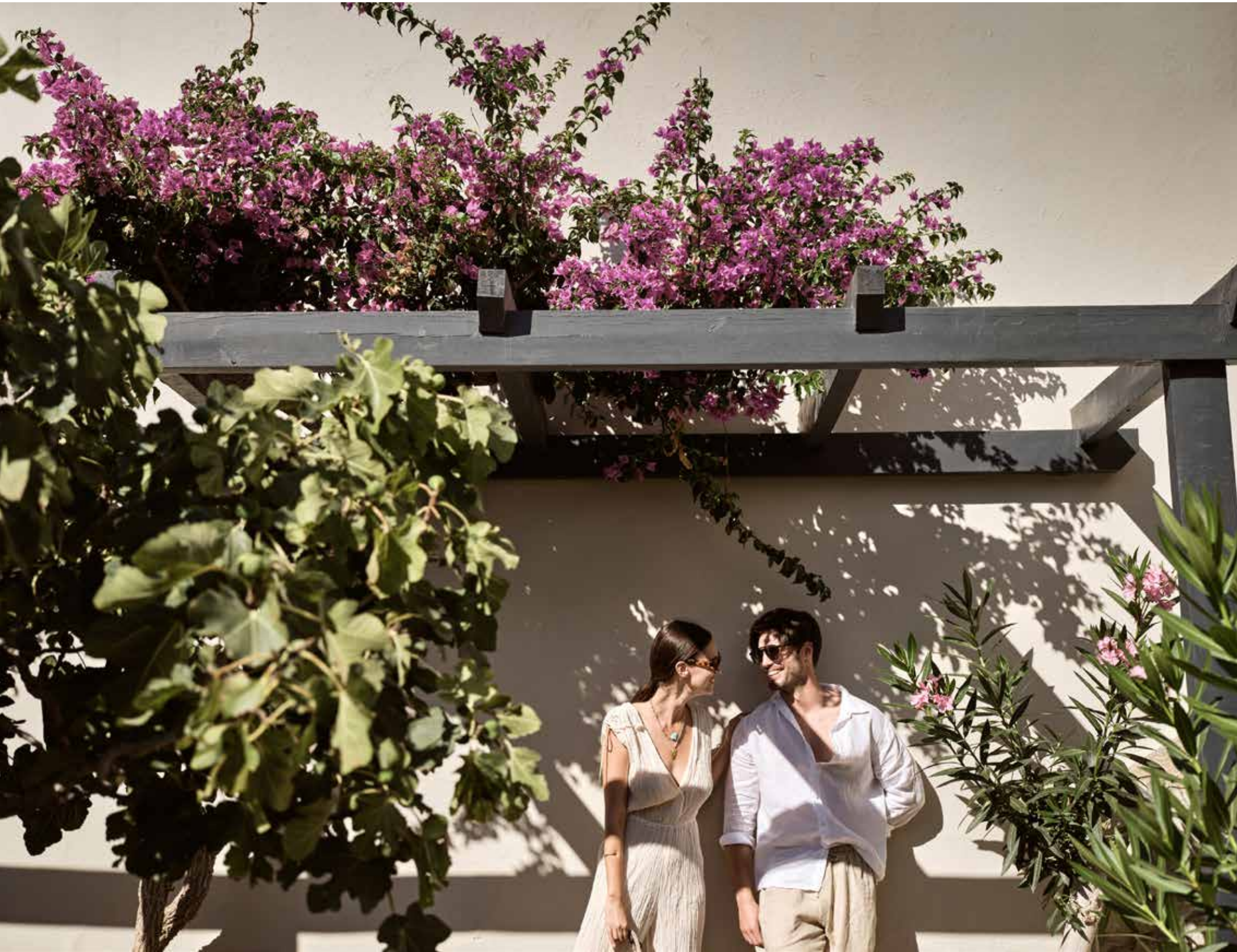
Clockwise from left: converse under the bougainvilleae; dip into a private pool; relax with a good book in comfort and style.

THERE'S NOTHING MORE IMPORTANT THAN PRECIOUS TIME WITH LOVED ONES. SOAK IT ALL UP IN EVERY MOMENT – AND IN EVERY CORNER.