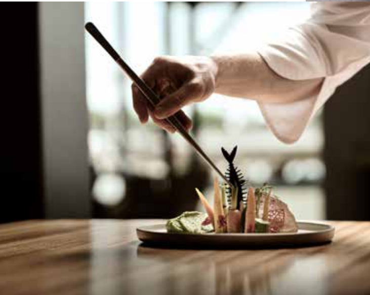
Clockwise from above: absorb the love and care in all our dishes; nourish your body with fresh, local ingredients; say yamas to life over long lunches and dinners.