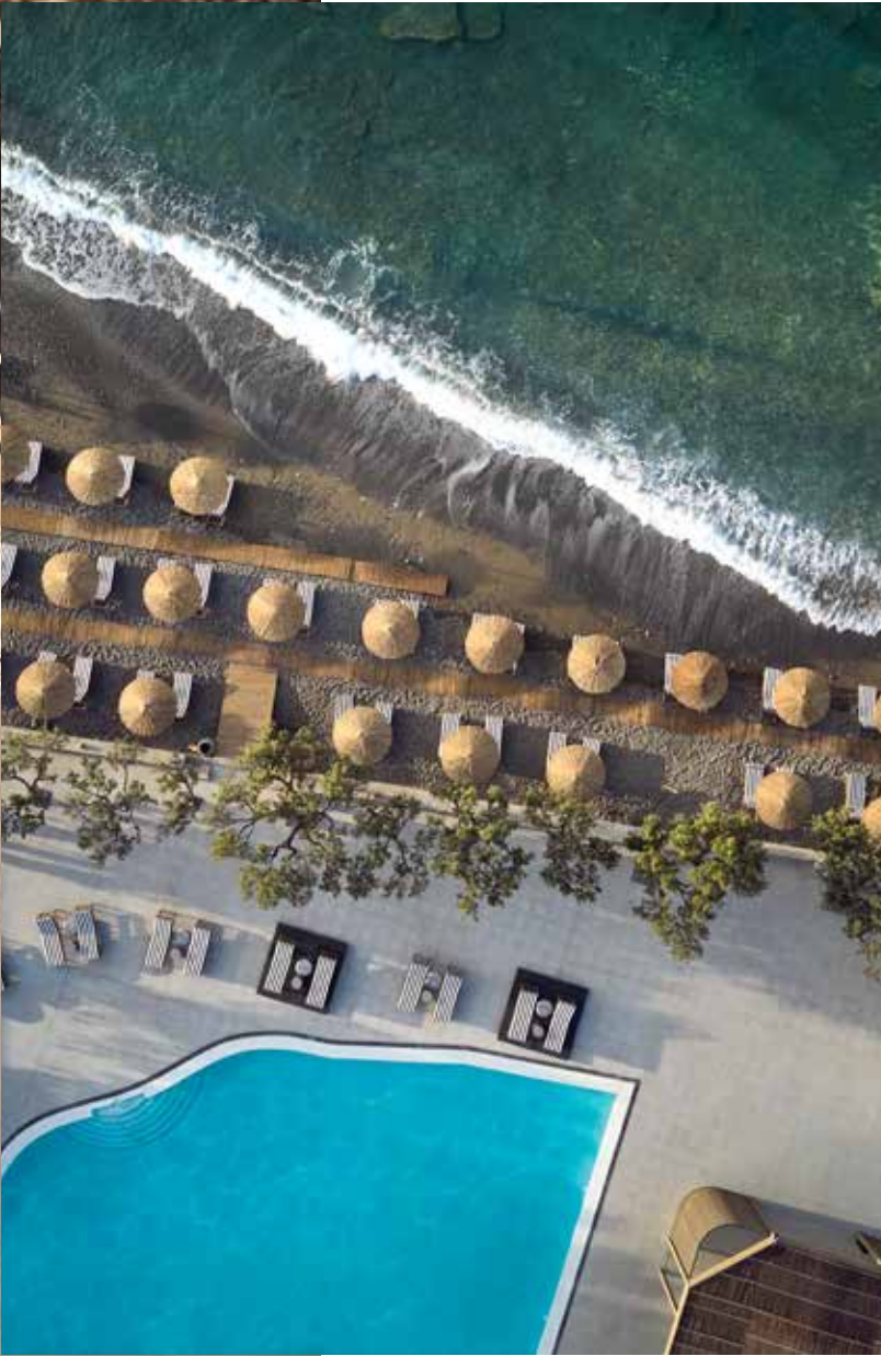
Clockwise from left: revel in chic sunsets with friends; spend lazy days at the pool, beach, or on a sunbed in between; sip elegant cocktails as you groove to lively DJ sets at Måre Måre; experience the barefoot beauty of Ierapetra.

AS DAY TURNS TO DUSK, SLIP INTO SERENITY AS YOU SOAK UP THE LAST OF THE SUN'S RAYS. TOMORROW, ANOTHER ADVENTURE AWAITS.